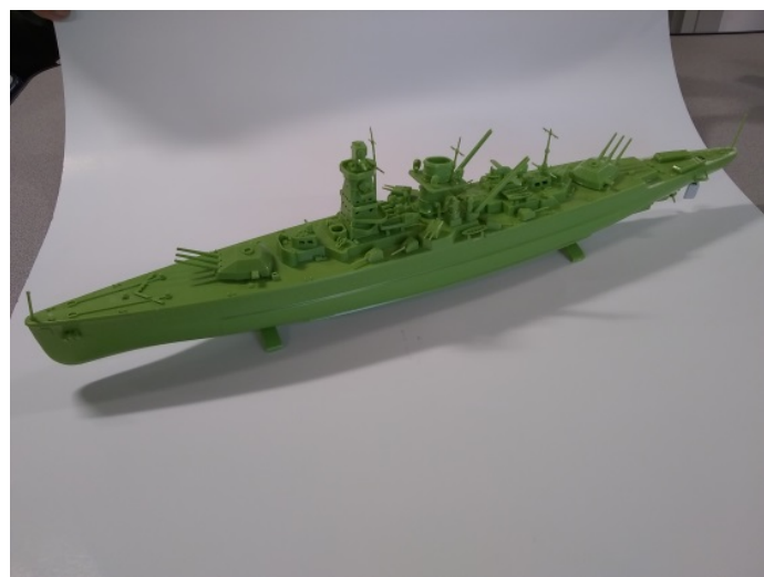
Chuck Converse brought in this classic from Ringo Models 1/350<sup>th</sup> scale Graf Spee