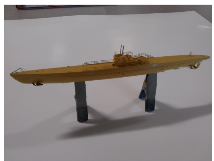
Jody Kelm added a lot of PE to this WIP 1/350th German U-boat Type IX D/42.