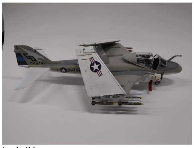
Rich Filteau's 1/48 Hobby Boss A6A Intruder commission build.