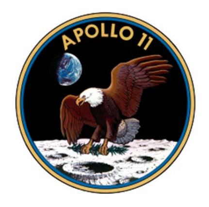
July Show and Tell